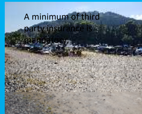
Area 1, Boat Park

A minimum of third party insurance is mandatory.